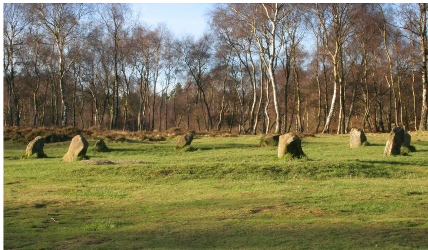
Nine Ladies Stone Circle, Stanton Moor

50p for Contributory members £1 for non members